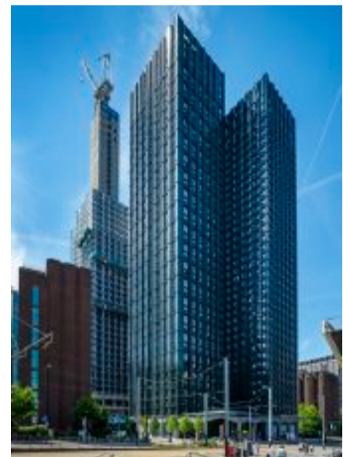
Ten Degrees (George Street) and College Road Croydon by Tide Construction and Vision Modular Systems