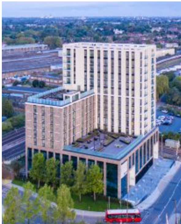
Bollo Lane, Chiswick by Tide Construction and Vision Modular Systems