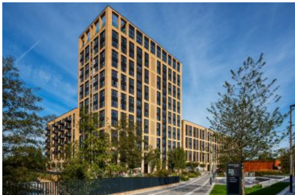
Greenford Quay, Ealing by Tide Construction and Vision Modular Systems