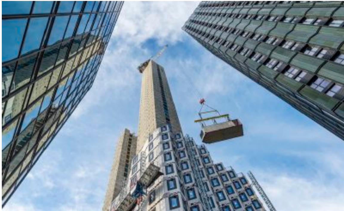
Module install by Tide Construction and Vision Modular Systems

Vision Modular was established over a decade ago to tackle three of the main challenges the construction industry was facing and continues to face - the housing crisis, the climate crisis and skill shortages. We use traditional construction materials, but with all the benefits of a modular, factory-built format.